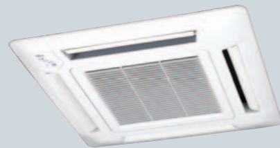
AUYG07LV AUYG09LV AUYG12LV AUYG14LV AUYG18LV