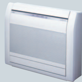
AGYG09LV AGYG12LV AGYG14LV